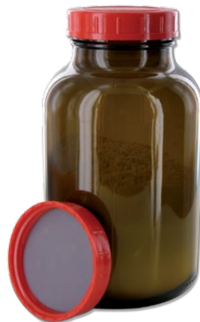
RB 1000 GT